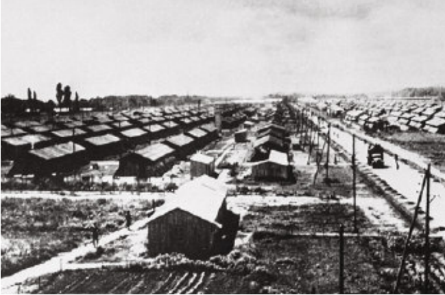
The Gurs transit camp, as seen from the water tower circa 1940, housed thousands of Jewish and other refugees. It was one of several internment camps in France.