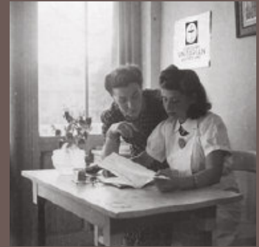
The flaming chalice became the symbol of the Unitarian Service Committee and was used on signs and badges for identification, as seen in this circa 1942 photo in a medical clinic in the Hotel Bompard internment camp.