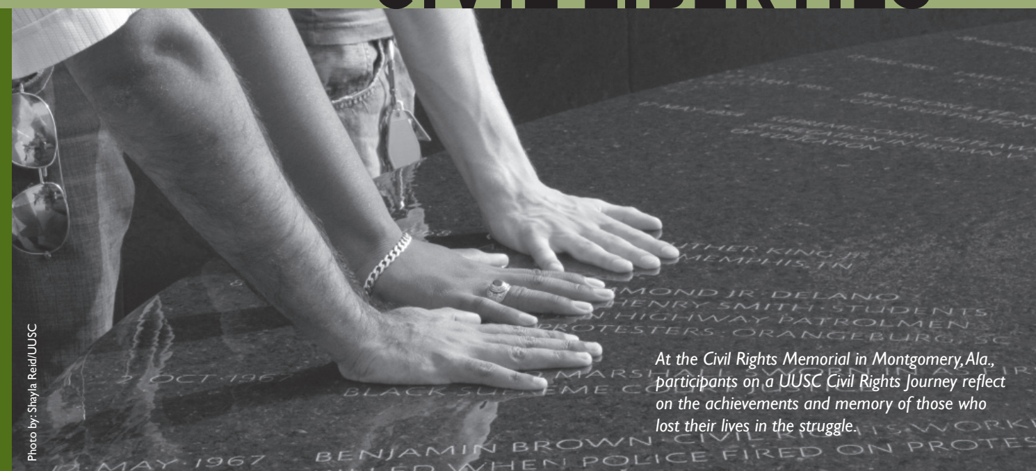
At the Civil Rights Memorial in Montgomery, Ala., participants on a UUSC Civil Rights Journey reflect on the achievements and memory of those who lost their lives in the struggle.

How often do you make a phone call without thinking about your right to privacy? Or write a heated e-mail or blog without thinking about your right to freedom of speech? It is easy to take civil liberties for granted, even though people around the world have fought and died to secure these rights.