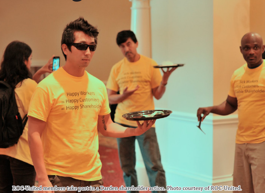
ROC-United members take part in a Darden shareholder action.

The newsletter of the Unitarian Universalist Service Committee