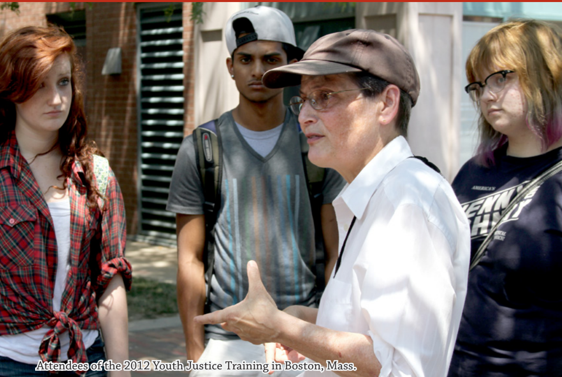
Attendees of the 2012 Youth Justice Training in Boston, Mass.

The Unitarian Universalist College of Social Justice (UUCSJ) embarks on its second Summer of Justice this year, with a particular emphasis on youth engagement. UUCSJ, a collaboration of the Unitarian Universalist Association and UUSC, sits at the intersection of UU faith and UU justice work — a crucial place for youth involvement.