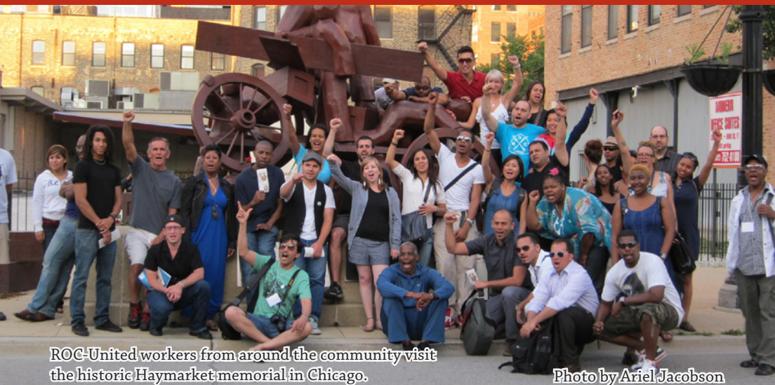
ROC-United workers from around the community visit the historic Haymarket memorial in Chicago.