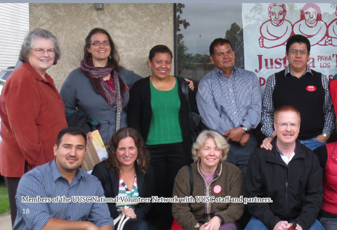
Members of the UUSC National Volunteer Network with UUSC staff and partners.