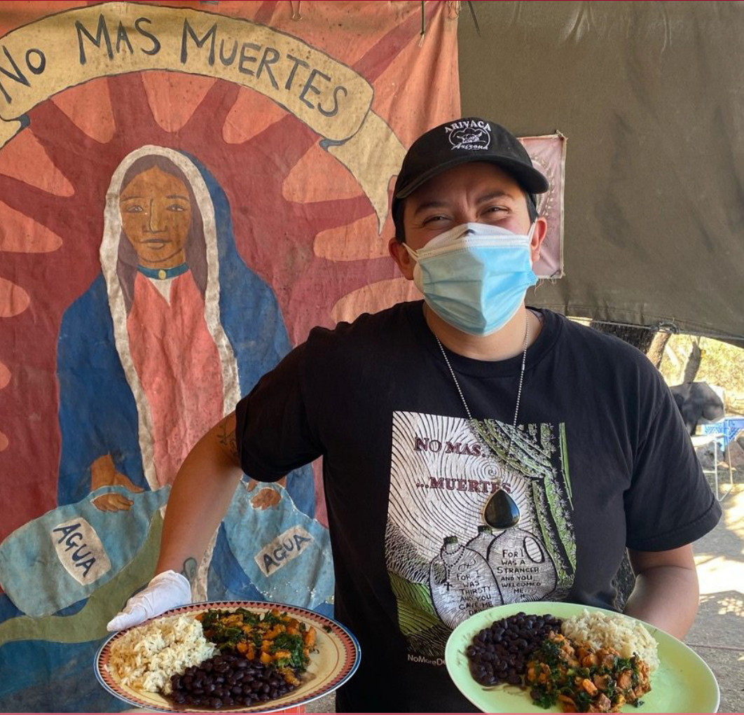
A desert aid volunteer preparing a meal at a humanitarian aid camp.

In addition to a place to stay, clothing, and food, the Scalabrinianas Misión con Migrantes y Refugiados (SMR) Casa Mambré shelter provides legal assistance and job placement for those navigating their way through the difficulties of the asylum process. SMR also gives support to former residents who live in Mexico City but are now unemployed or underemployed due to the pandemic.