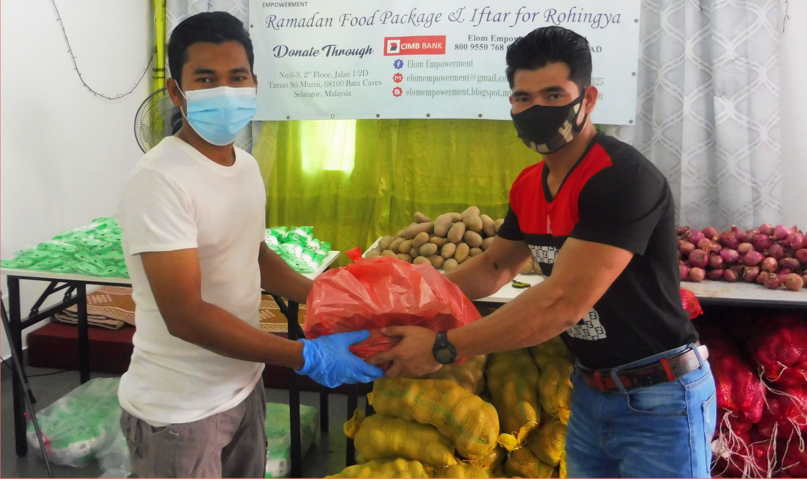
One of our Burma crisis response partners delivering food aid for Rohingya refugees who have fled violence and persecution.