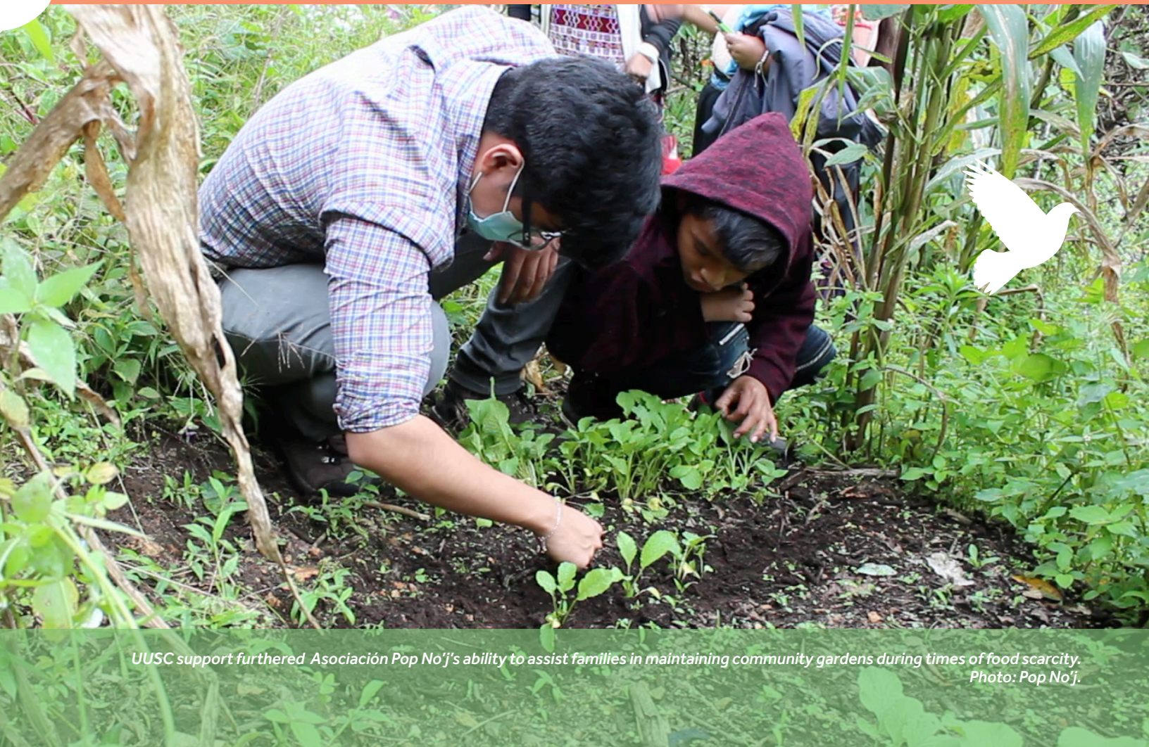
UUSC support furthered Asociación Pop No’j’s ability to assist families in maintaining community gardens during times of food scarcity.

— UUSC PARTNER SCALABRINIANAS MISIÓN CON MIGRANTES Y REFUGIADOS