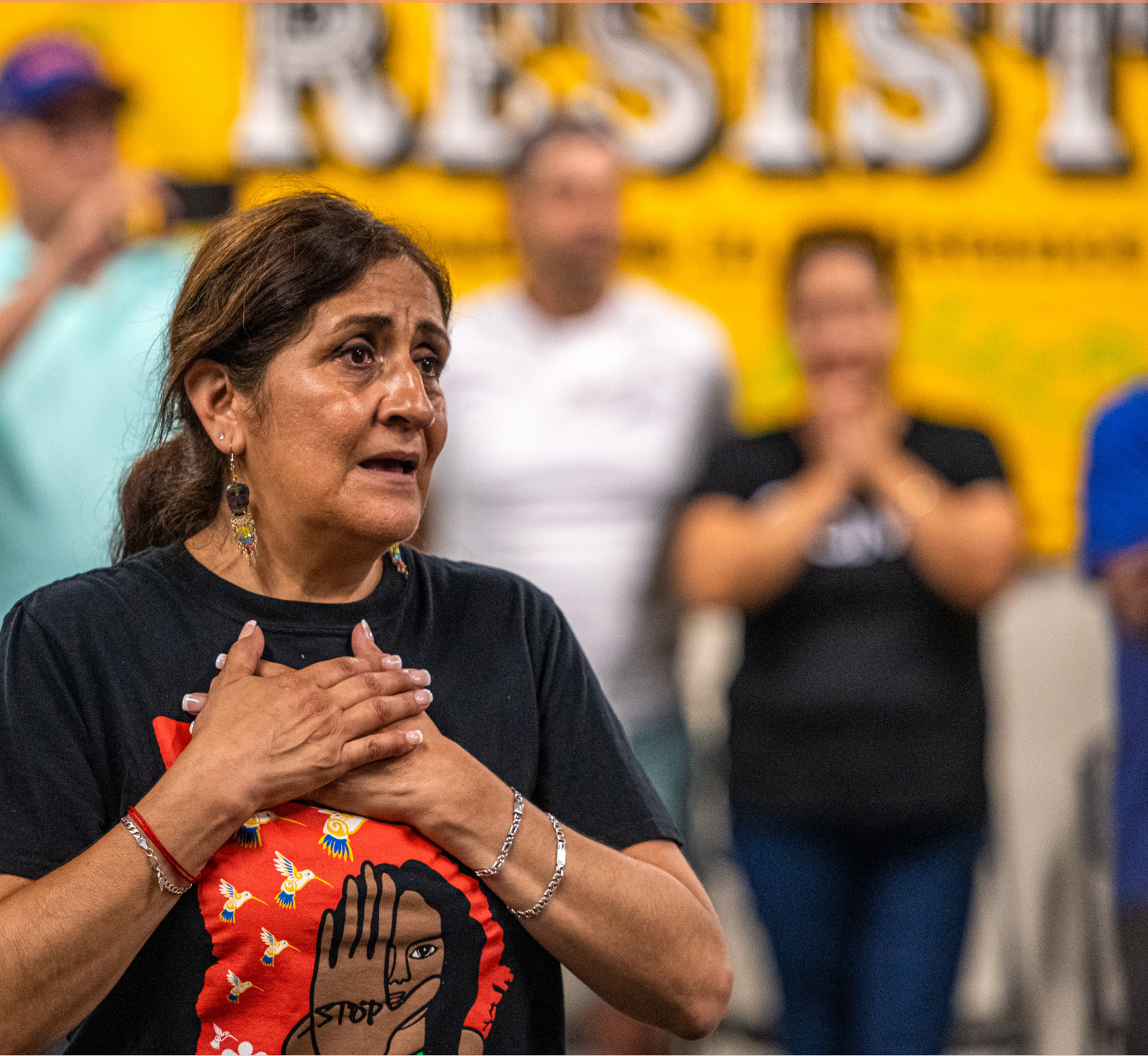
GLAHR continued to be a powerful voice in the movement for justice this year, organizing against anti-immigrant bills and mobilizing voters. They provided more than 1,200 small packages to canvassers and community participants containing hand sanitizer, face masks, and materials on COVID safety, along with booklets on how to avoid voter suppression, election registration dates, and where to vote.