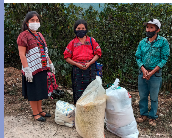
UUSC partner Pop No’j, distributing food and supplies to Guatemalan families facing food insecurity due to COVID.

It’s why this year UUSC ramped up our preparedness for future disasters by opening a revolving Emergency Relief Fund . It will ensure we are always ready to respond in ways that truly support people who have the least access to traditional aid, whenever calamity strikes unexpectedly. We are grateful for the generosity of our donors who have already contributed to this fund.