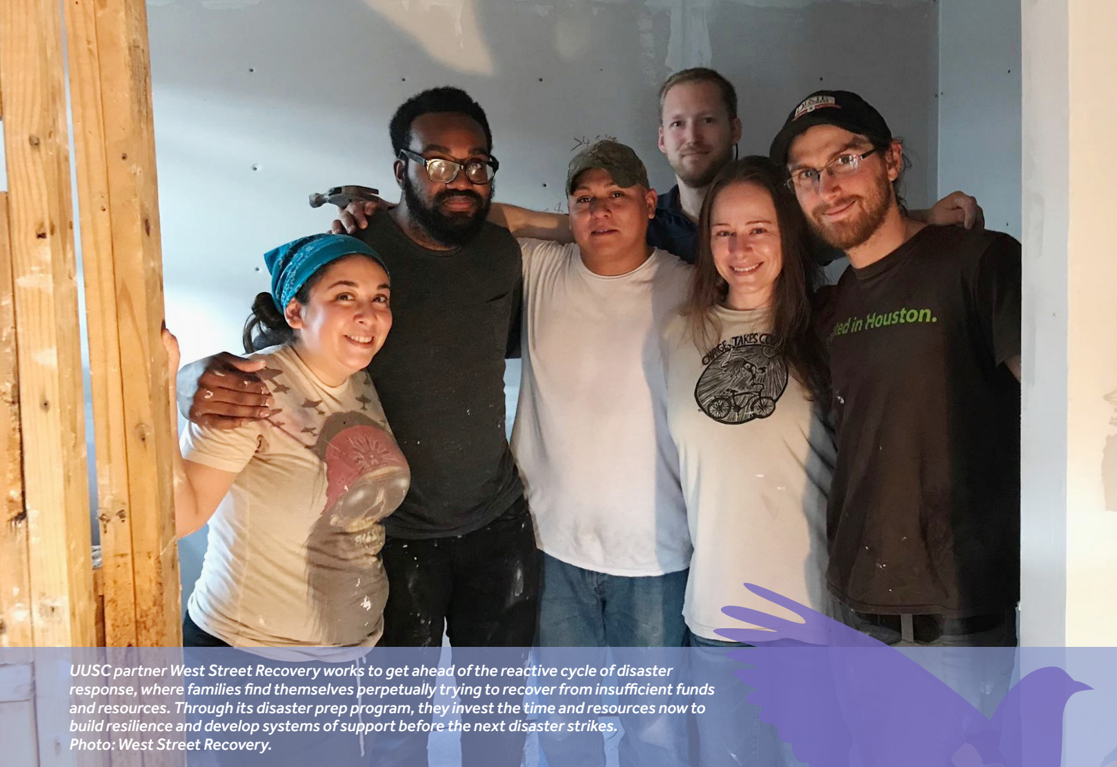
UUSC partner West Street Recovery works to get ahead of the reactive cycle of disaster response, where families find themselves perpetually trying to recover from insufficient funds and resources. Through its disaster prep program, they invest the time and resources now to build resilience and develop systems of support before the next disaster strikes.

“I’d like to see funders increase responsiveness and flexibility, because these events happen so quickly and the needs on the ground change quite quickly. So sometimes as organizers, as advocates, as organizations, we might make a request to use funds in a particular way and find that in a week, someone else has met that need or a more pressing need has come up.