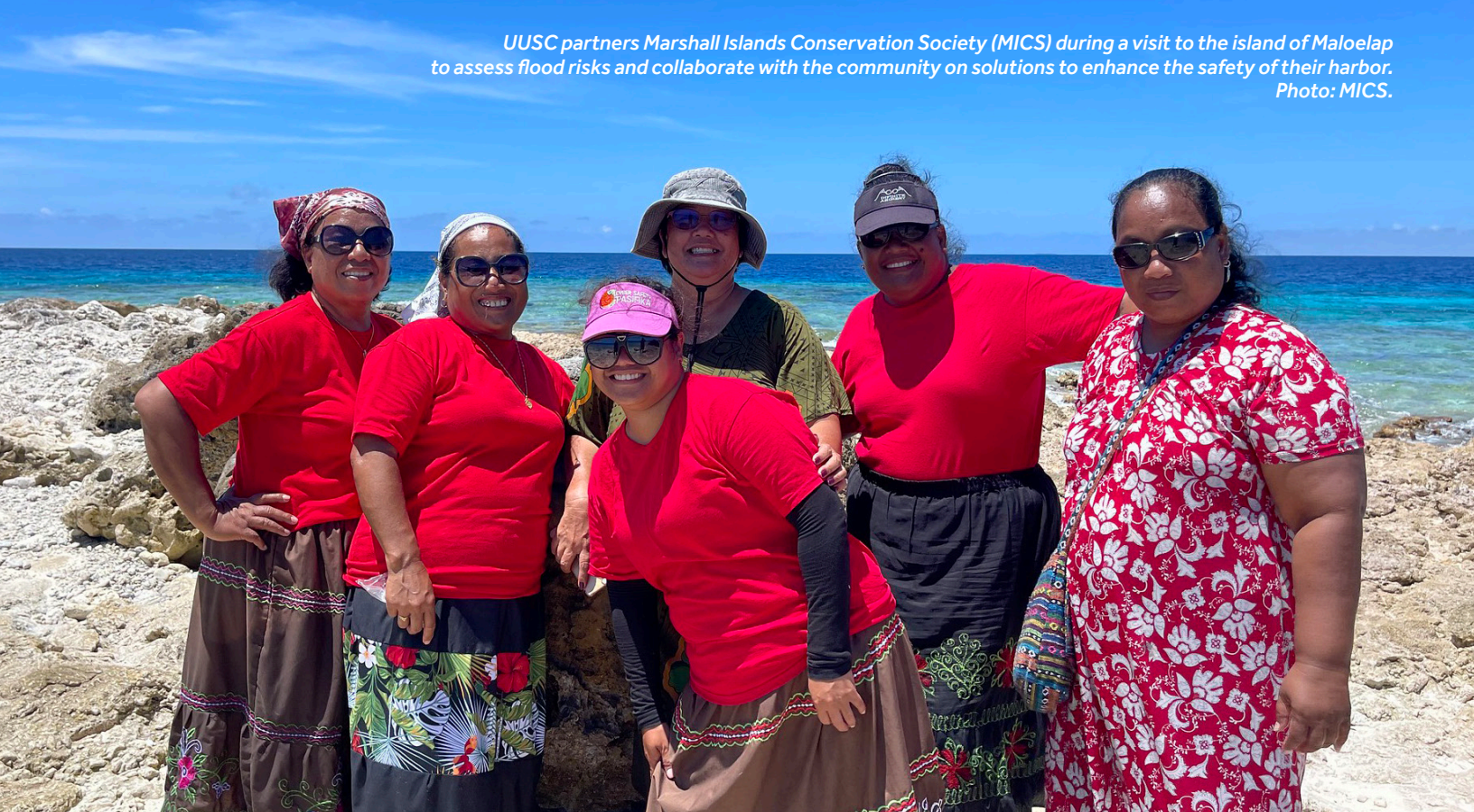
UUSC partners Marshall Islands Conservation Society (MICS) during a visit to the island of Maloelap to assess flood risks and collaborate with the community on solutions to enhance the safety of their harbor.