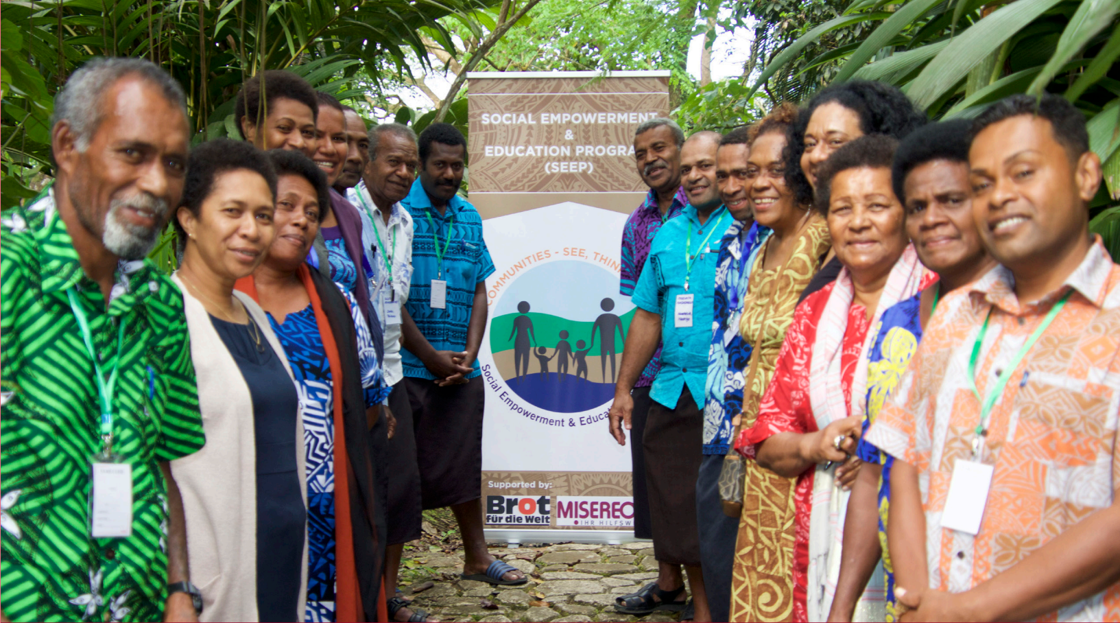
Members of UUSC’s partner Social Empowerment & Education Program (SEEP) gather together.

different stages of adaptation and migration. Those who have already relocated are able to share their wisdom and lessons learned with those who are just beginning to plan to move their communities. The first to relocate have learned that proximity to water supplies, the type of soil and landscape, and discussions around land ownership are all important considerations. And they know the difficulty of leaving behind the only home they’ve ever known only to feel like a guest in a new location. So SEEP has created ways to preserve ancestral knowledge through a robust mapping of losses these communities will sustain: cataloging of soil type, traditional plants, medicine, food, folklore, chants, dance, song, history, genetic resources, genealogy, kinship ties, and burial sites.