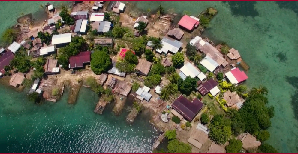
Aerial view of Pacific Island homes threatened by the rising tides of climate change.

On Wagina Island, well water has become salinated from sea level rise, contaminating the community’s drinking water source. UUSC’s grant provided six 5,000-liter water tanks and three 3,000-liter water tanks.