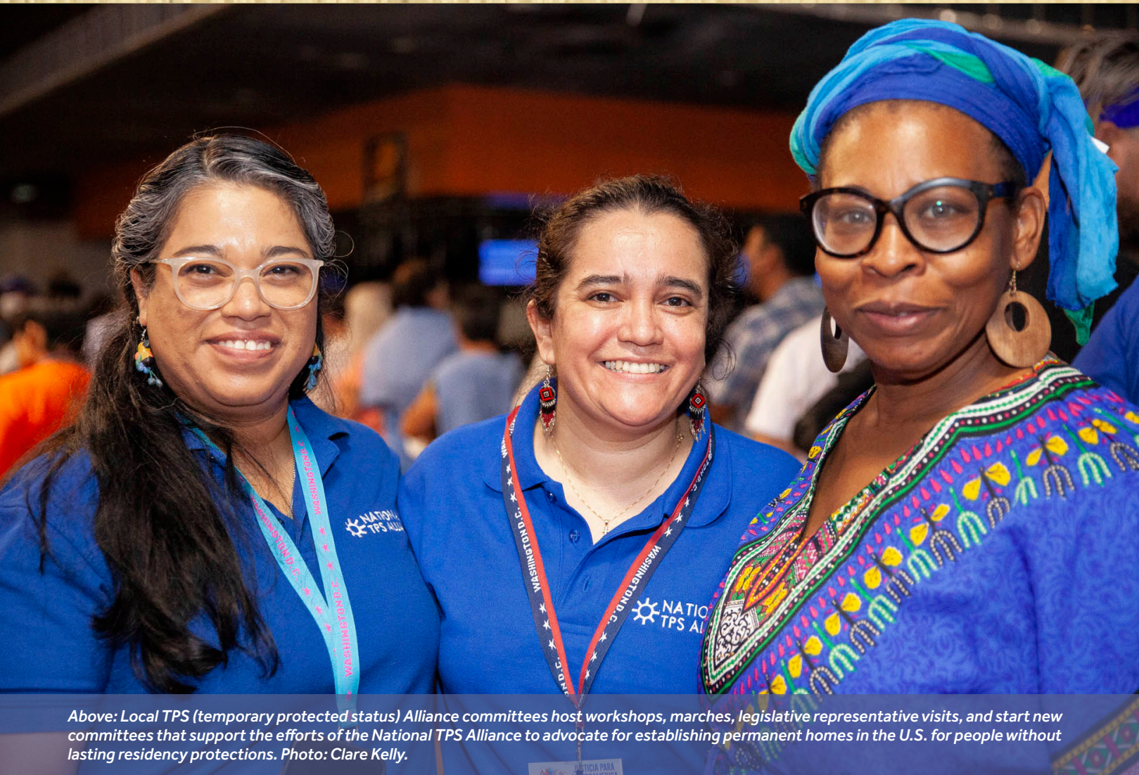
Above: Local TPS (temporary protected status) Alliance committees host workshops, marches, legislative representative visits, and start new committees that support the efforts of the National TPS Alliance to advocate for establishing permanent homes in the U.S. for people without lasting residency protections.